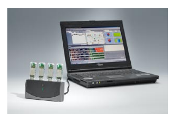
Analyzer tool for multi-channel monitoring of wireless networks (in cooperation with Perytons)

Dresden elektronik offers for both frequency ranges a compatible deRFdevelopment kit. The kit contains USB radio sticks, programming adapters and an extensive software package. This package provides a complete implementation of the IEEE