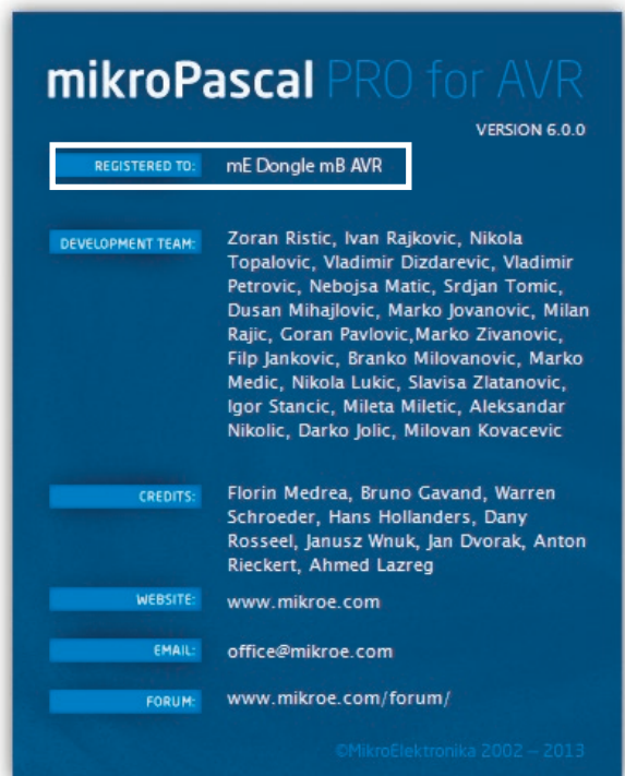
Figure 1-2: mikroPascal PRO for AVR® About Window