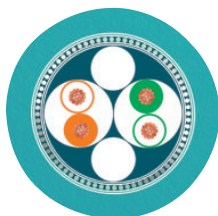
PUR ETHERNET 2x2 FLEX [93E]