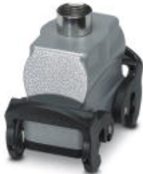
HEAVYCON B10 coupling housing, with double locking latch, height: 77.5 mm, with 1 x M25 gland, straight cable outlet

Please be informed that the data shown in this PDF Document is generated from our Online Catalog. Please find the complete data in the user's documentation. Our General Terms of Use for Downloads are valid ( http://download.phoenixcontact.com )