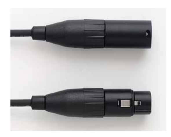
Model 6902 3-Pin XLR (M) to XLR (F) patch cord: 10, 15, 20, 25 feet.