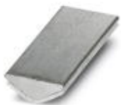
Insertion profile, Color: silver