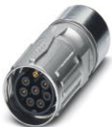
Cable connector, straight, SPEEDCON locking, M17, Number of positions: 5+3+PE, Type of contact: Socket, Crimp connection, shielded: yes, Cable diameter: 9 mm...11.2 mm

Please be informed that the data shown in this PDF Document is generated from our Online Catalog. Please find the complete data in the user's documentation. Our General Terms of Use for Downloads are valid ( http://phoenixcontact.com/download )