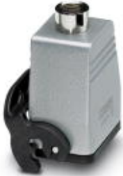
HEAVYCON coupling housing B6, with single locking latch, height 73 mm, with support 1x M20

Please be informed that the data shown in this PDF Document is generated from our Online Catalog. Please find the complete data in the user's documentation. Our General Terms of Use for Downloads are valid ( http://download.phoenixcontact.com )