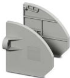
Flange cover, Number of positions: 0, Color: gray

Please be informed that the data shown in this PDF Document is generated from our Online Catalog. Please find the complete data in the user's documentation. Our General Terms of Use for Downloads are valid ( http://phoenixcontact.com/download )